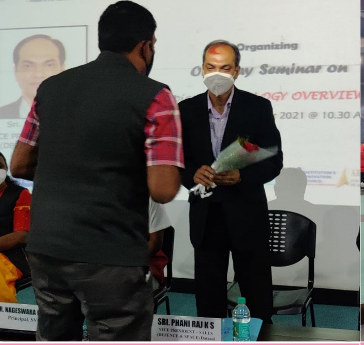
Honouring the guest