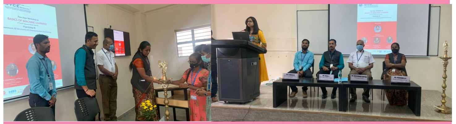
Official inauguration of the workshop by lightening the lamp by Dignitaries

Machine learning is a branch of artificial intelligence (AI) and computer science which focuses on the use of data and algorithms to imitate the way that humans learn, gradually improving its accuracy. Machine learning is an important component of the growing field of data science. Through the use of statistical methods, algorithms are trained to make classifications or predictions, uncovering key insights within data mining projects. These insights subsequently drive decision making within applications and businesses, ideally impacting key growth metrics. As big data continues to expand and grow, the market demand for data scientists will increase, requiring them to assist in the identification of the most relevant business questions and subsequently the data to answer them.