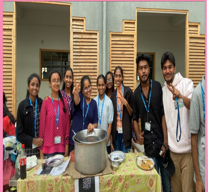
Students and faculty members participation during “Food Carnival ”