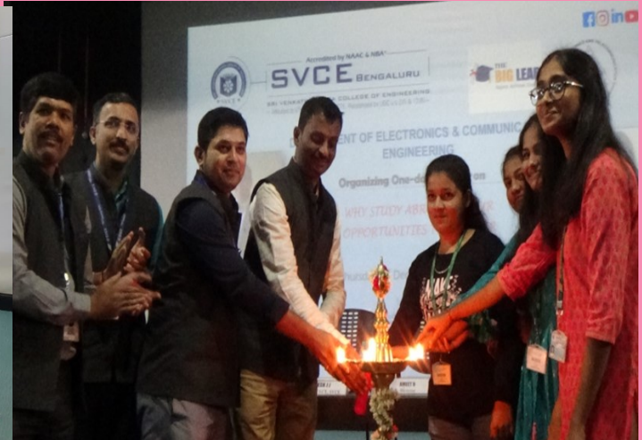
Official inauguration of the seminar by invocation song and by lighting the lamp