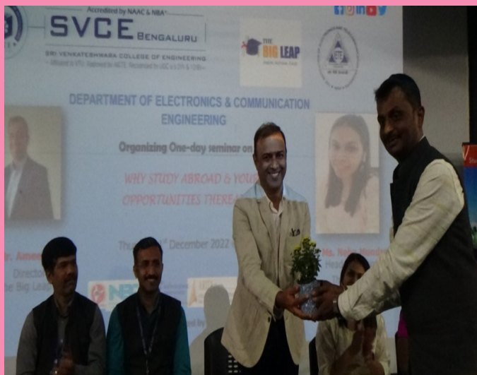
Honouring the Guest