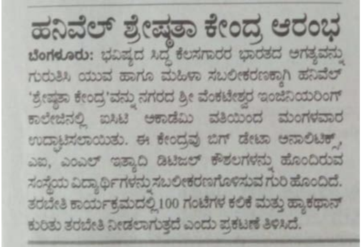
Fig 7 Article about the event in kannada news paper