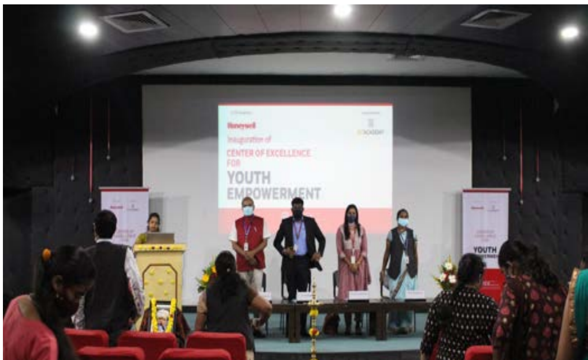
Fig 1 Inauguration by Guest of Honor