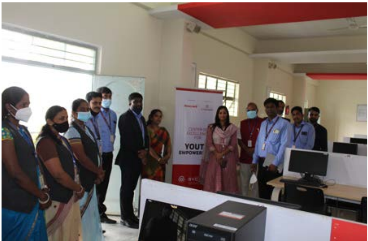
Fig 5 Centre of Excellence