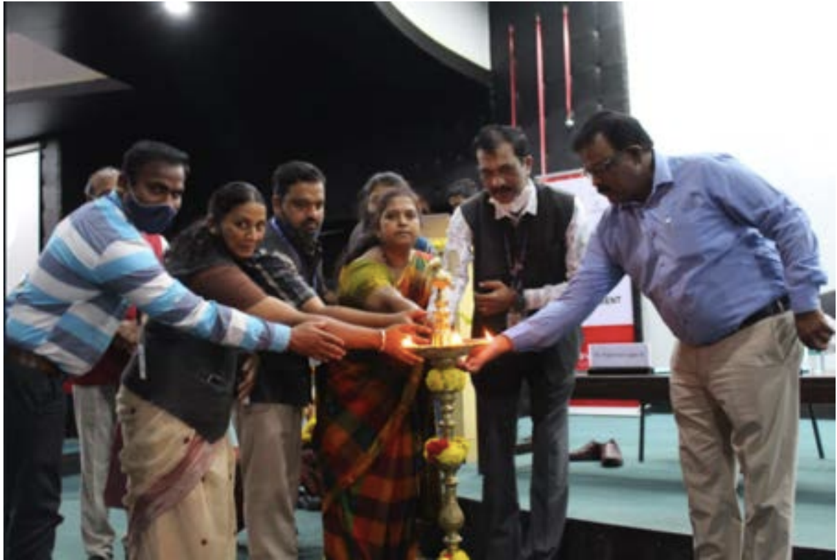
Fig 2 Lightning the lamp