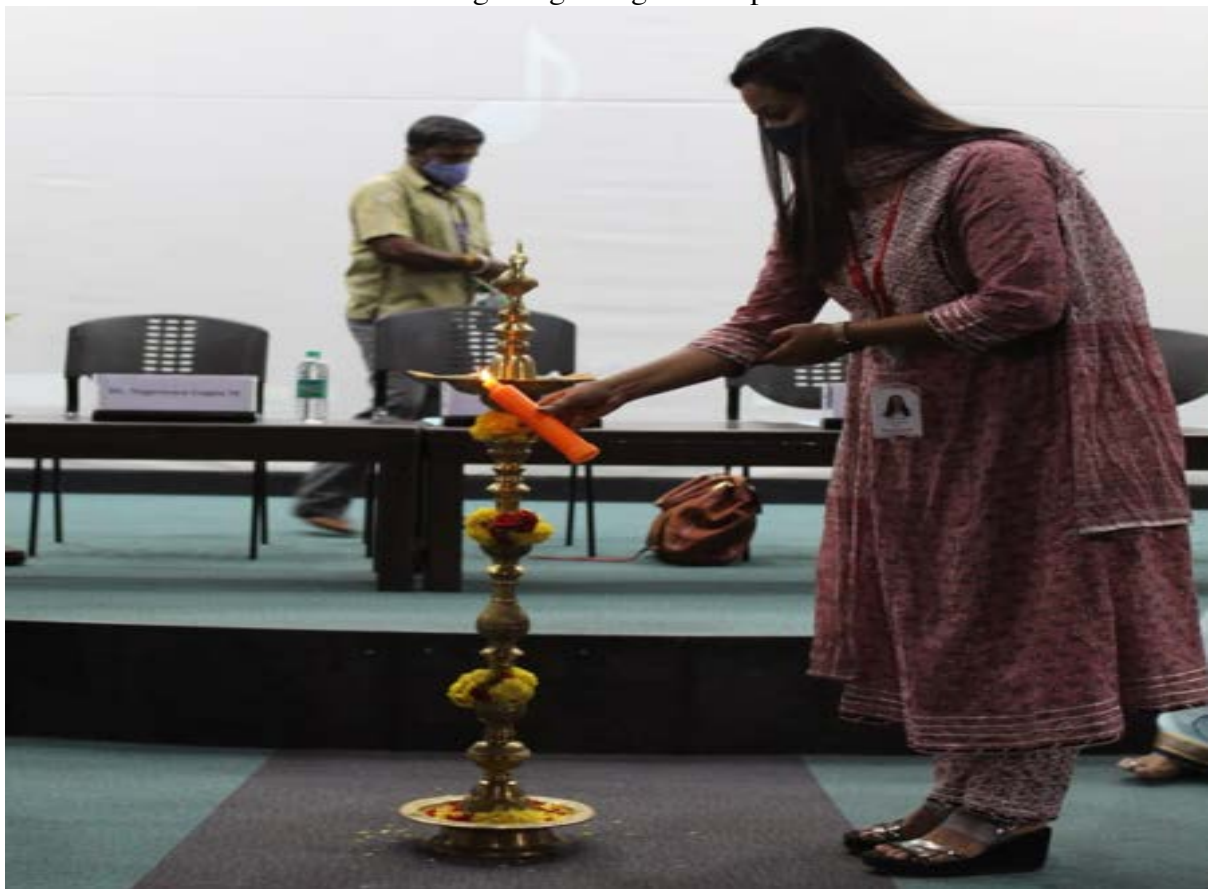
Fig 3 Lightning the lamp by guest of honor