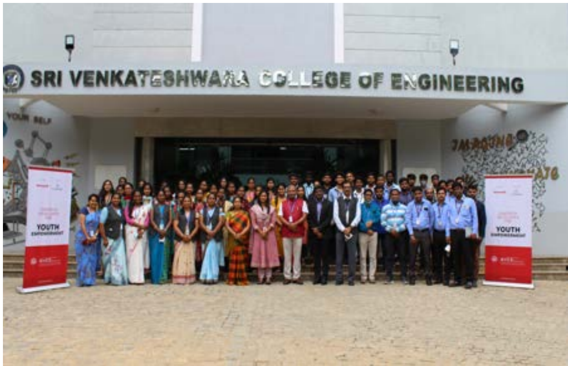
Fig 6 Group photo