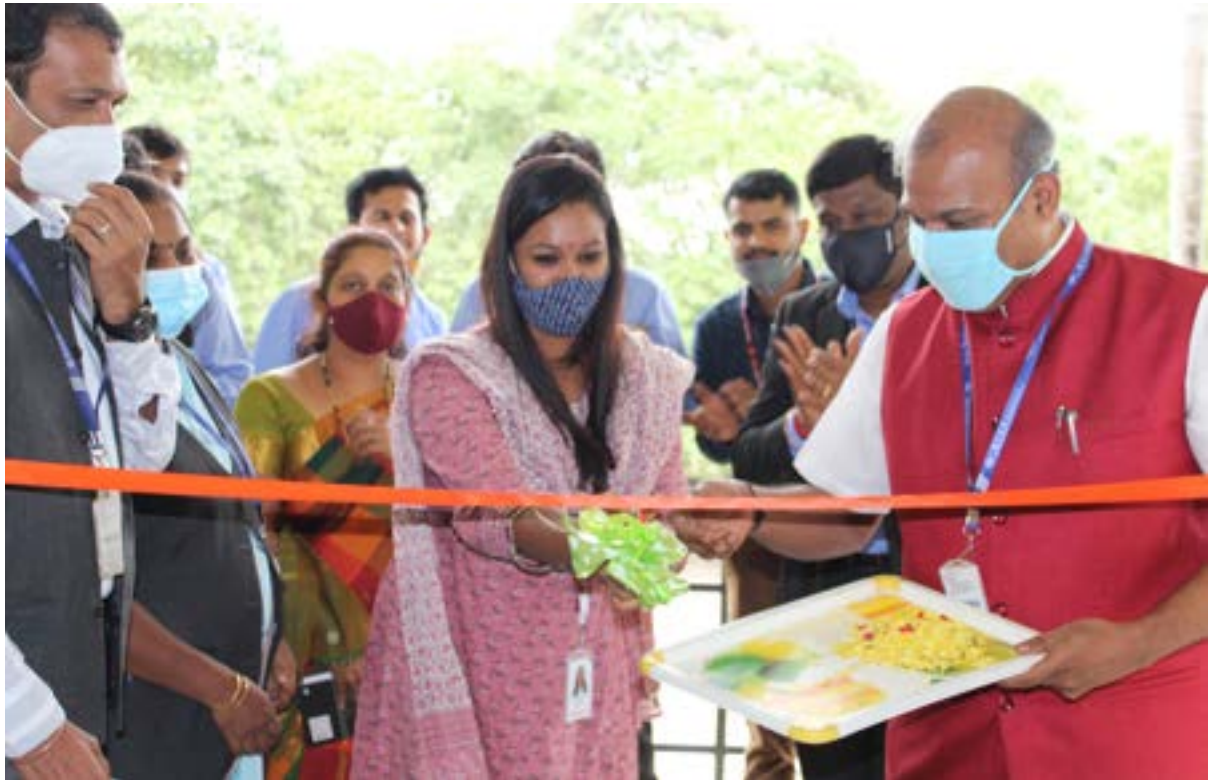
Fig 4 Inauguration of Centre of excellence