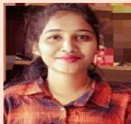
Hamsa V – 75.28% ( 1VE18MBA20)