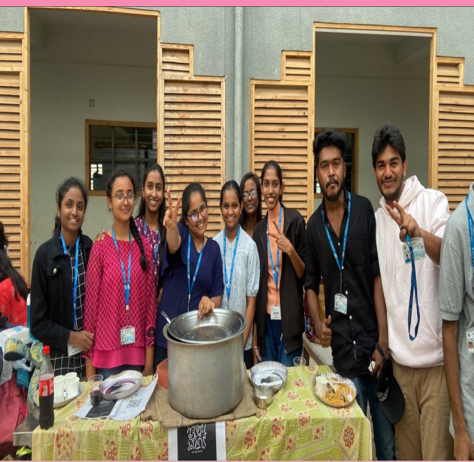
Students and faculty members participation during "Food Carnival"