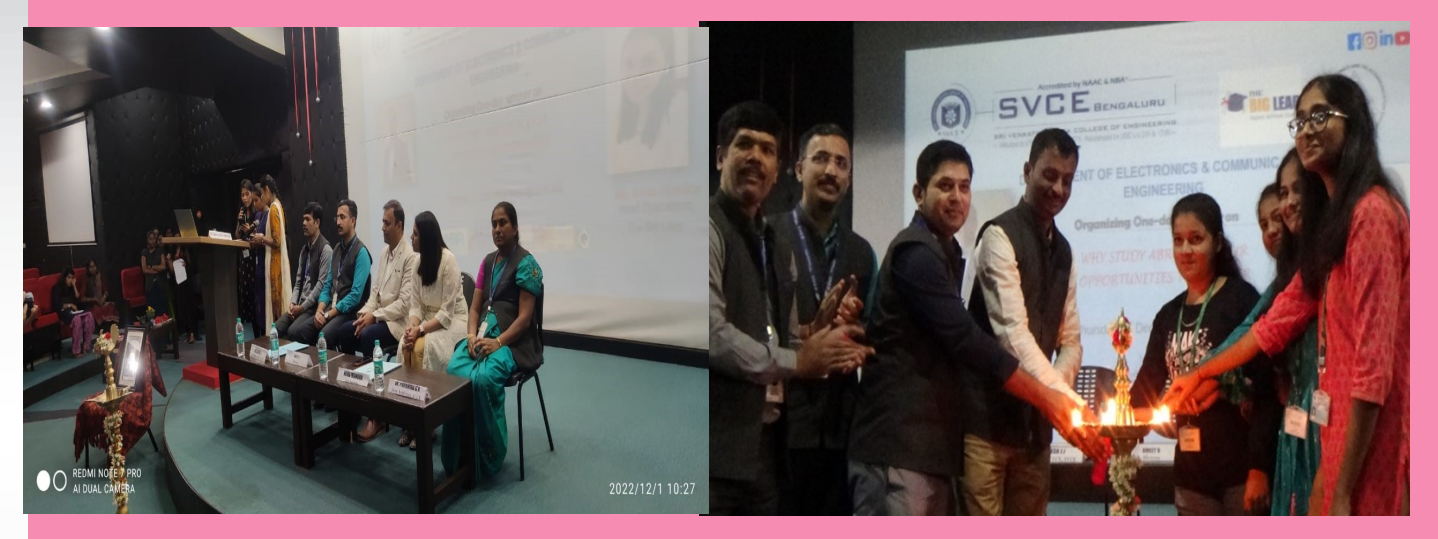
Official inauguration of the seminar by invocation song and by lighting the lamp

Event Description: Information about latest development in the Education sector and up-to-date knowledge of the Country and University details, visa requirements and trends in the Job markets, decisions in terms of better courses and career opportunities was delivered to students. Assured students that guidance will be given regarding course option matching in abroad. They explained the process of their counseling team which will put students at ease by suggesting programs and country options that not only match their current profile but also for a successful career.