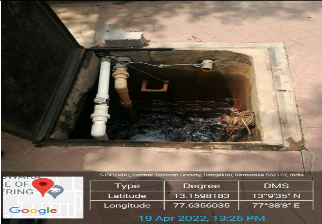
Underground Water Tank